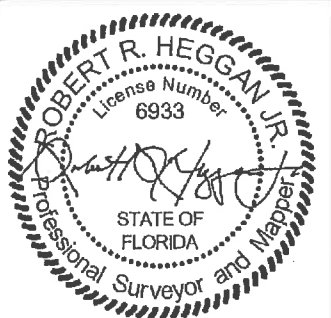
EXHIBIT A - SKETCH AND DESCRIPTION